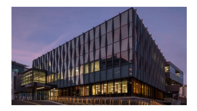
Wellington Children Hospital