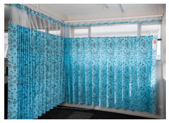
Hospital Curtains Mesh top

Mactrac Care offers two options within the Antimicrobial Curtain range: